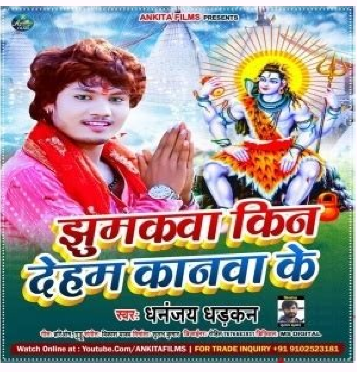
Awadheshi premi new song 2018 download video.